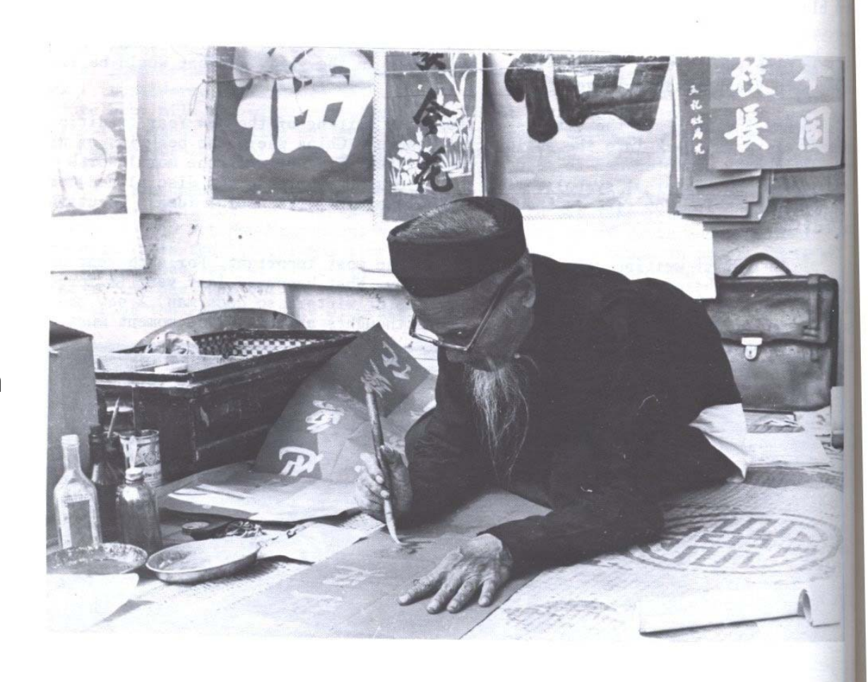
A Vietnamese scholar deeply engrossed in the thoughts of writing wishes for the New Year.